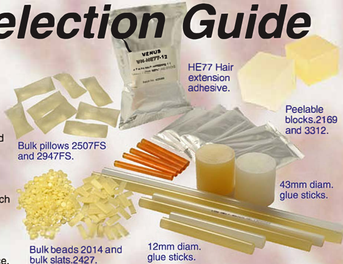
Bulk pillows 2507FS and 2947FS.

Polyamide Glues: High performance. Excellent chemical and temperature resistance.