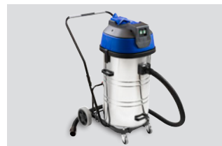
HSM ProfiPack P425 has an optional suction device