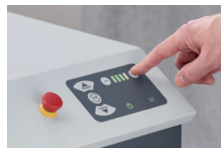
Feed-in speed adjustable