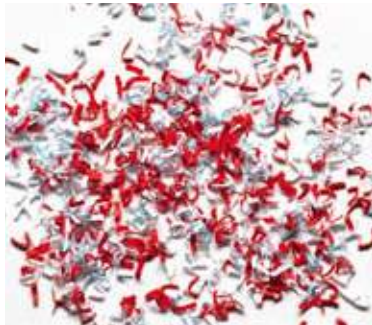
HS Level 6 – particles