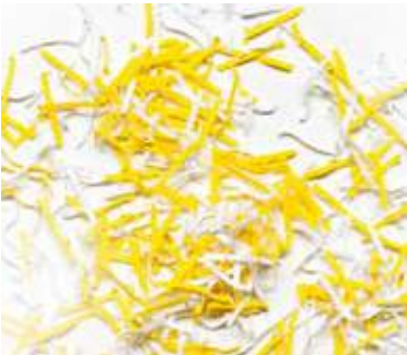
Security level 5 – particles