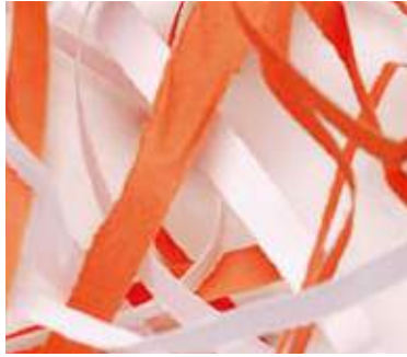
Security level 2 – strips