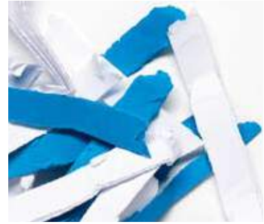
Security level 2 – particles