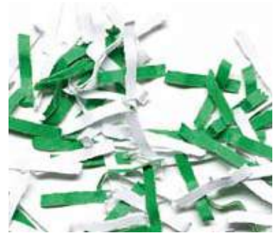
Security level 4 – particles