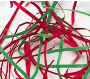
Security level 3 – strips