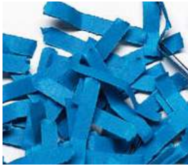
Security level 3 – particles